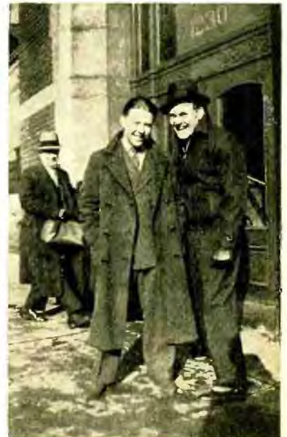
TWO STARS —George Goebel, the Little Cowboy, and the Arkansas Woodsawyer—we mean the Arkansas Woodchopper.