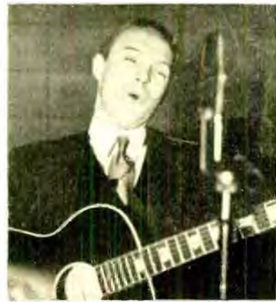
THE NEWEST PICTURE of Skyland Scotty Wiseman, snapped by a candid camera during his morning program with Lulu Belle.