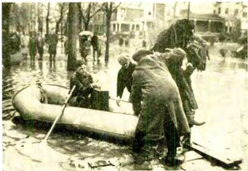
And here's a rescue scene typical of those where your contributions helped. A collapsible rubber boat is used at Scranton, Pennsylvania, to rescue a mother from the worst flood in the city's history. An estimated 400,000 flood victims received aid from the Red Cross throughout the vast eastern flood area.

Stand By goes to press, we have received a total of $14,029.75 from neighborly Mid-West folks who wanted to help eastern neighbors.