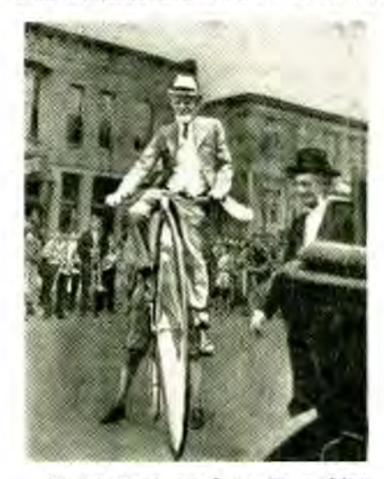
Uncle Ezra used to be a bike "scorcher" in his day.

The Coles county folks turned out in full force April 14 when Uncle Ezra and the Hoosier Hot Shots made personal appearances at Mattoon, the county seat. Uncle Ezra with his powerfull little 5-watter sta-