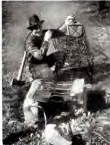
"It's like this."

Plenty of buttered buns, sliced tomatoes, sliced onions, a barbecue relish and coffee complete Arkie's demands for an ideal picnic menu—until they're all gone and then he brings out apples and bananas to eat