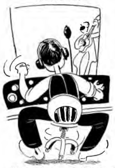
"'You get a line and I'll get a pole' and we'll string him up."