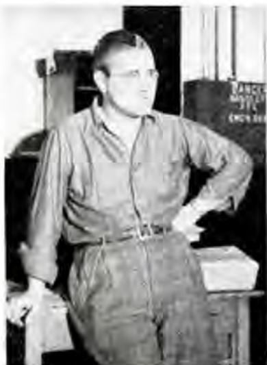
"Sleeps under blankets."