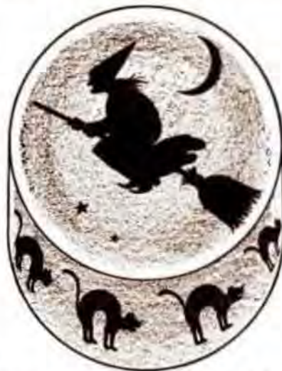
A festive cake for a spooky party.

If time for preparation permits it, a jack-o-lantern salad may be your choice. Cut the top off an orange for each individual serving and remove