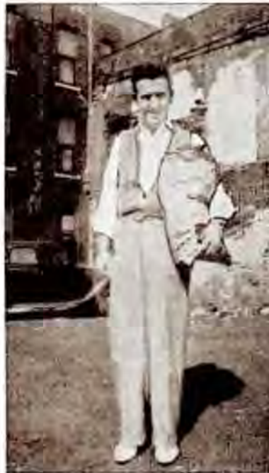
Red Foley "bringing home the bacon." Red is to be one of the judges in the new song contest.

the permission of the owner. In view of this fact we have had to ask all WLS artists to refrain from copying and sending out the words to the songs which they sing, so please bear this in mind and do not expect them to send you the words to any song. They'd like to oblige you and we'd like to have them do so but it is unsafe and cannot be allowed.