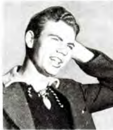
Under the sign of Mickey Mouse.

A. Well, I was born'd down at Blue, Oklahoma, about 15 miles east of Durant, and I'm proud of it. If I had it to do over again there ain't no changes I care about makin'. I was born two days late for Christmas in 1913 which makes me 22 years old, be 23 next December 27. I was the youngest of six kids, three boys and