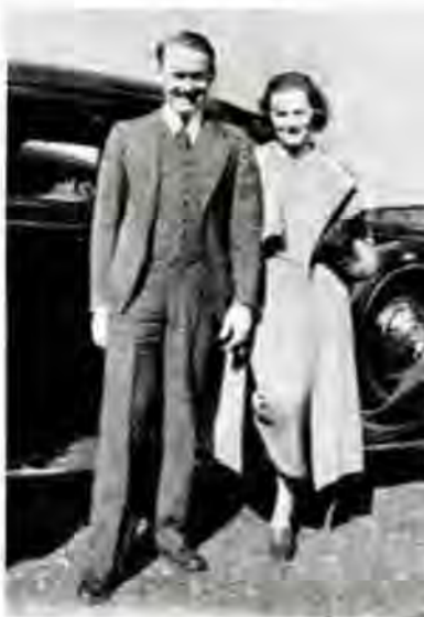
Guest conductors of "The Old Hayloft".