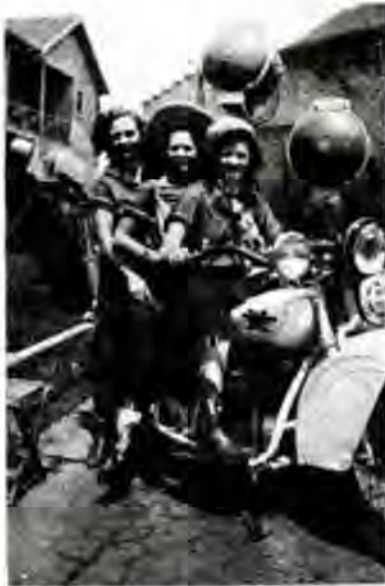
The Montana Cowgirls mounted on a trusty steed at the Hal Roach Studios in Culver City, California. You may recognize the first of the "rough-riders" as the little singing cowgirl, Patsy Montana.

Monday, November 23, to Friday, November 27