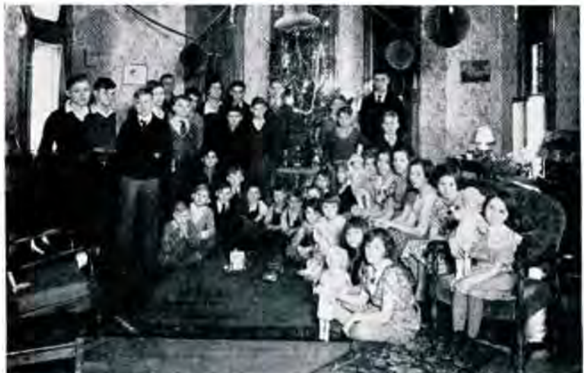
The 33 youngsters in the Clay County Children's Home at Knightsville, Indiana, are still enjoying their radio donated by the Christmas Neighbors' Club last year. The radio-giving project is being repeated this Yuletide season.