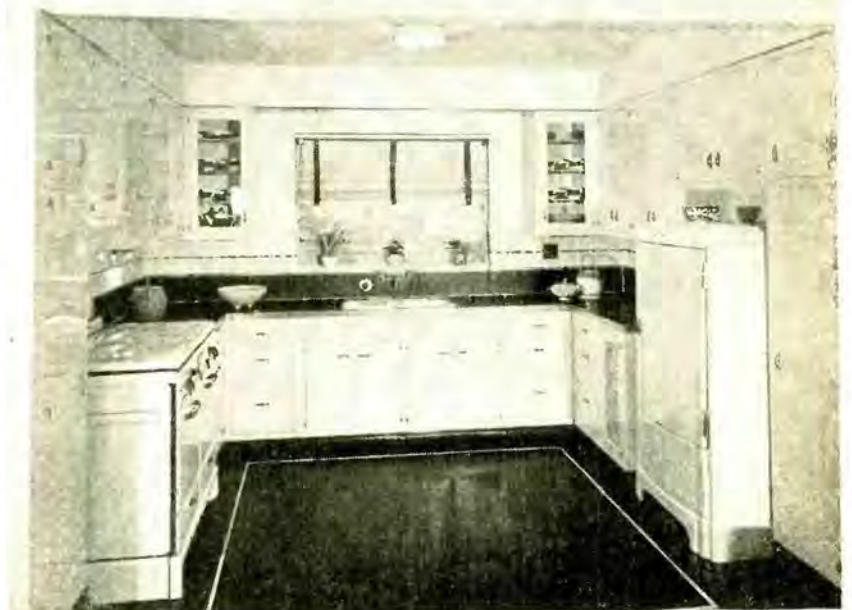
This modern, U-shaped kitchen with its level work surfaces, built-in cupboards and convenient arrangement would please any homemaker.

Wouldn't it be a joy to work in such a kitchen? If you can't have it