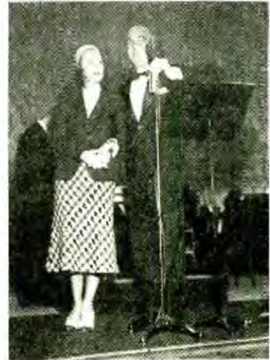
Ruby Keeler Jolson visits Al during a rehearsal of his new Tuesday night program, featuring Sid Silvers and eccentric songstress, Martha Raye.