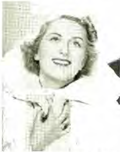
Blonde Vivian Della Chiesa, soprano star, of the Monday night "Contented Hour," skyrocketed to radio and opera fame in a few short months; but she began to sing when she was three.