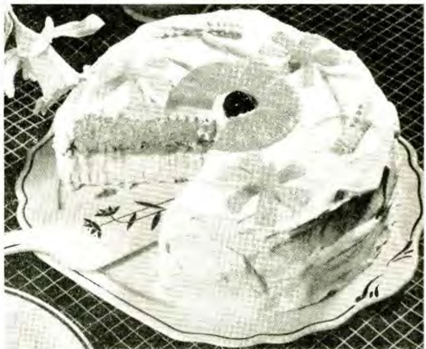
This is the colorful result obtainable from Mrs. Wright's recipe for daffodil cake. Looks pretty good!

The identical recipe for daffodil cake may be used, and the two mixtures baked in the same angel food cake pan, alternating the yellow and white as you do for a marble cake. Made this way, no pineapple filling is required and pineapple sherbet would be a delicious accompaniment.