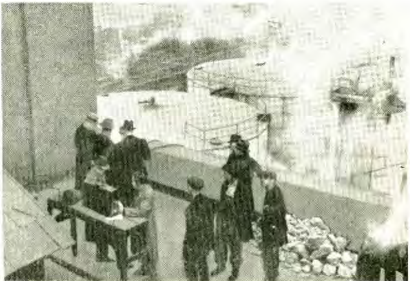
Students learn about industries from School Time broadcasts actually made from those industries. Here is one being made from the world's largest oil refining plant, that of the Standard Oil Company of Indiana, at Whiting. School Time is heard every school morning at 9 o'clock.