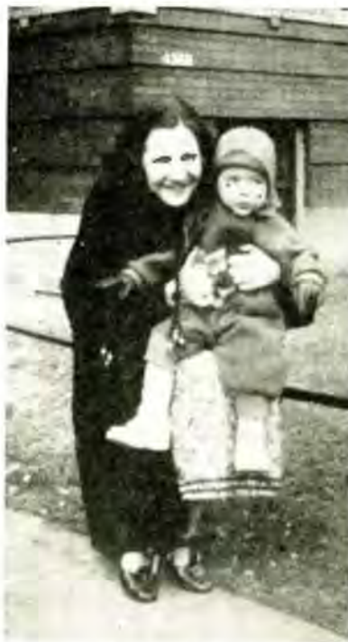
Millie and Billy

Beat together the first four ingredients. Add pineapple and blend well. Line the bottom of a refrigerator pan, about 12x3 \frac{1}{2} inches, with a third of the very fine graham cracker crumbs, spread half of the pineapple