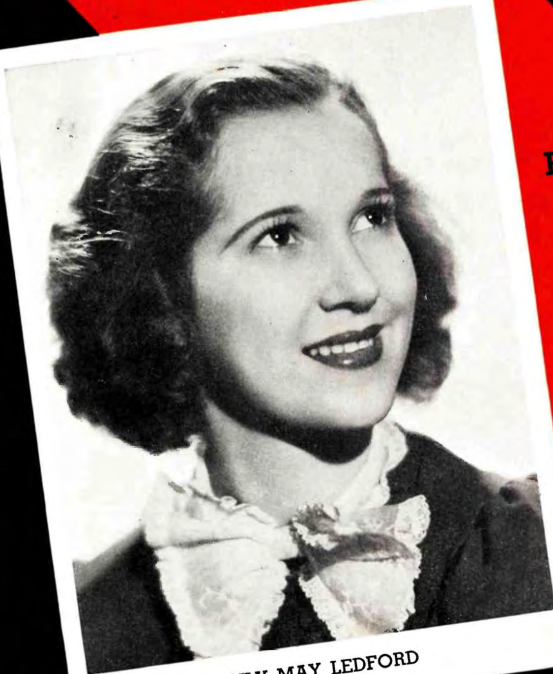
LILY MAY LEDFORD