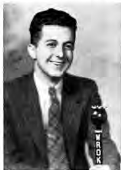
Prefers sports announcing.