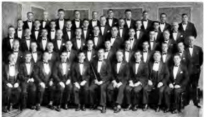
Members of the Normaendes Sangforening, who will be guest artists in the old hayloft, May 15.

More than 24,500,000 American families have radio sets, according to CBS' recent survey. Receivers are being bought currently at the rate of 28 sets per minute, and in the first three months of this year 1,300,000 sets were purchased for homes and automobiles.