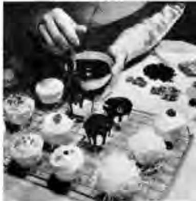
Melted bitter chocolate decorates dainty cup cakes.

This icing may be made extra fluffy by adding a half-dozen marshmallows, cut in small pieces, when you take the icing off the hot water, beating well until the marshmallows are melted.