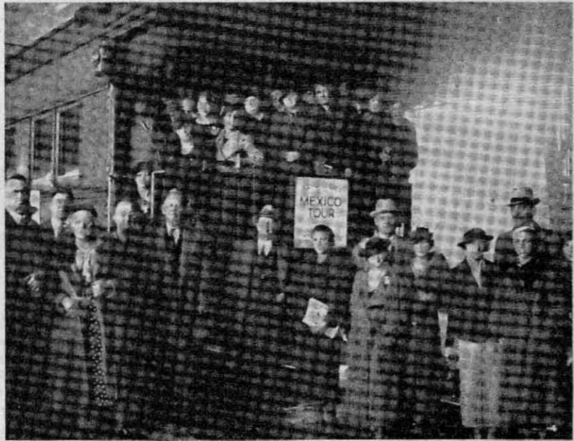
Start of the Prairie Farmer-WLS tour.