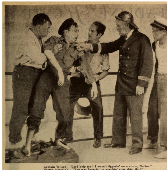
Captain Wilson: "Lord help me! I wasn't figgerin' on a storm, Norton." Norton (sternly): "You was figgerin' on wreckin' your ship, tho?"

The following photographs are from 1929 and 1930 issues of Radio Digest and What's on the Air?