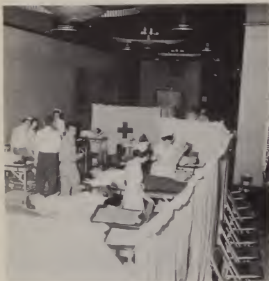
The lower lounge of the Center Theater during blood-letting for the "Parade of Pints" on May 24th.

A total of 120 employees of the National Broadcasting Company contributed one pint of blood each to a 14 table mobile unit of the Red Cross installed in the lower lounge of the Center Theater on May 24th. This was the second time in the past three months that NBC personnel have made contributions of blood to aid the war wounded in Korea. In February 113 employees made contributions.