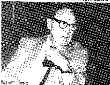
reminiscing about his career in an interview recorded in 1970.