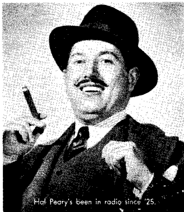
Hal Peary's been in radio since '25.