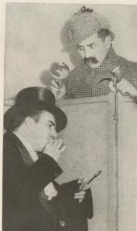
Suburban Holmes and Silk Hat Sammy at WAAT in "Shadow the Shadow."