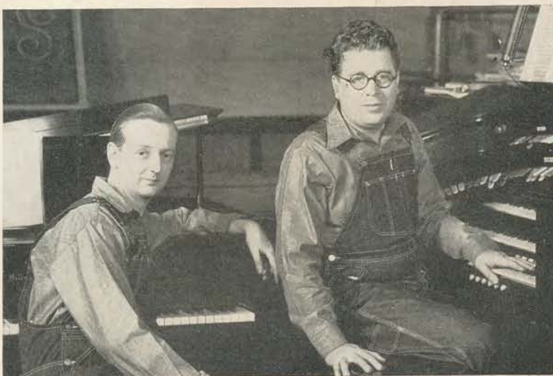
John Brown and Ralph Waldo Emerson