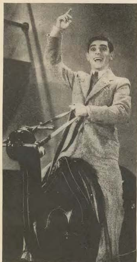
Eddie Cantor, on his cantering "Chimmie," as they arrive in Hollywood.