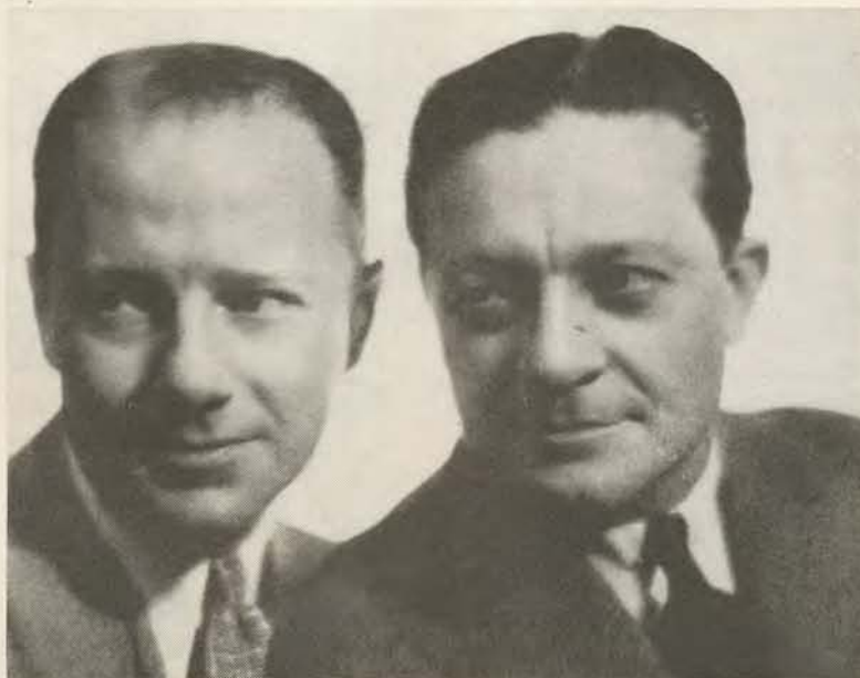
Amos 'n' Andy when they are not Amos 'n' Andy but just plain Freeman F. Gosden (left) and Charles J. Correll.