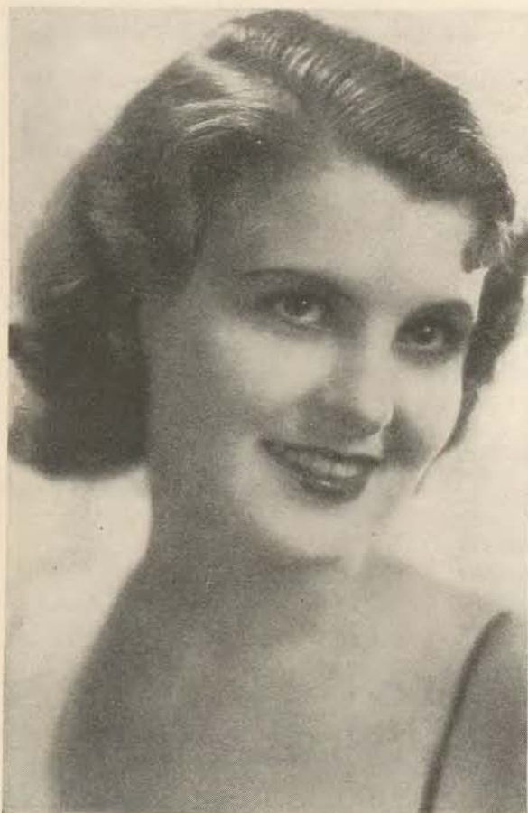
Dorothy Knapp, noted stage star, and former NBC artist, appears to be drawing interest at high rate in the beauty mart.