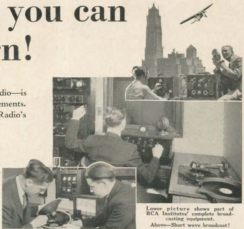
Experts show you how and why.