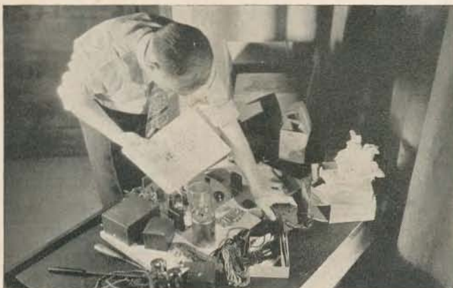
Study at home in spare time. Special laboratory available in some courses.

It is easy to learn these interesting branches of radio. Study is made simple at the RCA Institutes, through advanced methods and association with the largest, most complete research Laboratory in the radio industry. The four resident schools—at New York, Boston, Philadelphia and Chicago—offer elementary and advanced courses in practical radio.