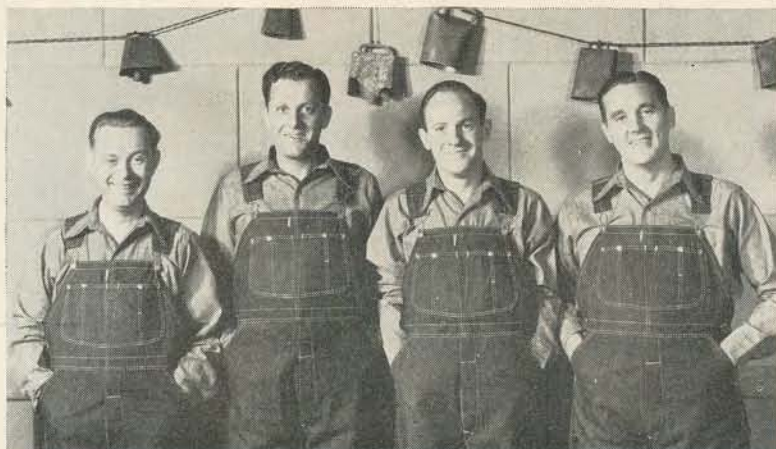
The Lee Overall Boys

It's seven o'clock and all is well By the clock upon the wall Good morning folks—how do you do; We're the Boys in Overalls!