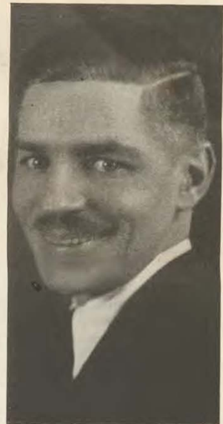
Don't mind him, gentle readers. He's only Mr. Bones, just an old dark who thinks he's funny. Me, Mr. Bones? Well, so that cat's out of the bag, is it?