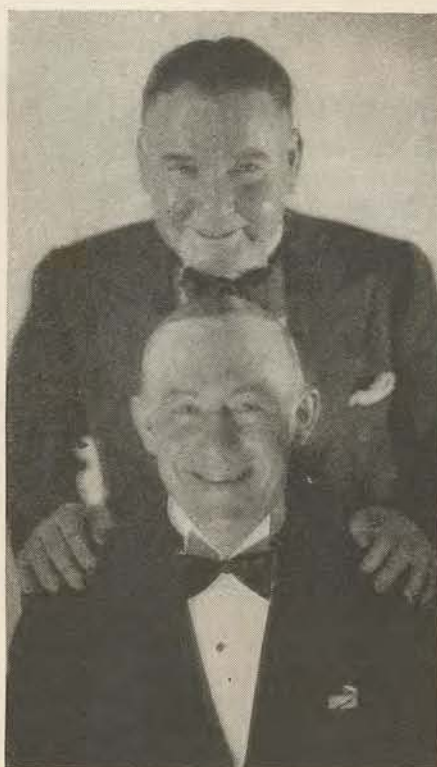
Away with care. We're the happiness pair.

also started life as a choir boy, but quickly abandoned the thought of a musical career and went to work in the U. S. Custom House. Then he went into banking, which in turn he gave up for manual labor.