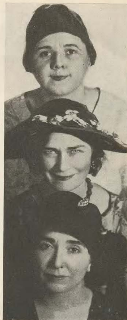
Clara, Lu and Em, famous gossipers who discuss world affairs.

But Clara says, why Lu, that's a splendid idea and I wouldn't think of doing it when the credit all belongs to you. Well, anyway somebody should do it. Now you see they are talking about putting a tax on everything except just things that you eat so I thought that ought to stir up a lot of thinking especially on the part of people who are living on borrowed money or on help they are getting from money