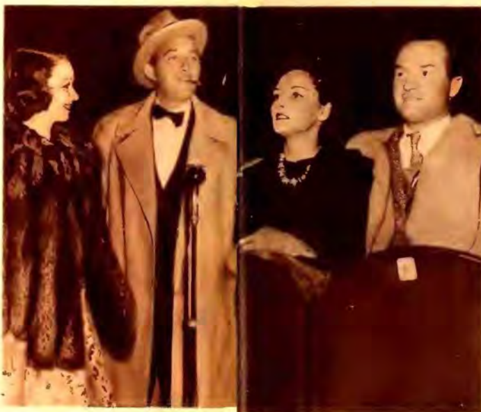
■ Mr. and Mrs. Bing Crosby at the premiere of Bing's picture, although he'd rather be at home, tucking the kids in their beds.