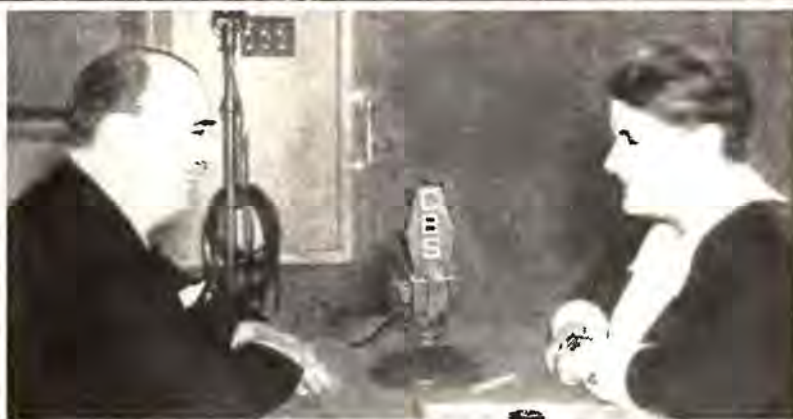
■ Mary Margaret McBride interviews the King of Jazz, Paul Whiteman.