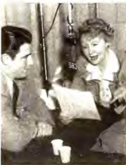
De Wolfe Hopper Junior guest-stars on his mother's program, Hedda Hopper's Hollywood, over CBS.

She came up to his table. "Ned!" she said softly. "I'm so glad you're