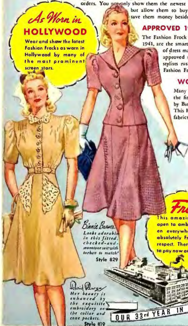
Binnie Barnes Looks adorable in this fitted, checked-and-monotone suit with turban to match! Style 829