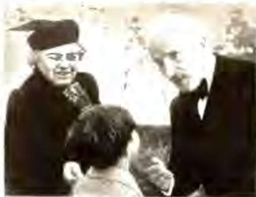
■ Maestra Toscanini with his wife and grandson.

(In-Bulletin for November 30, December 7, 14 and 21)