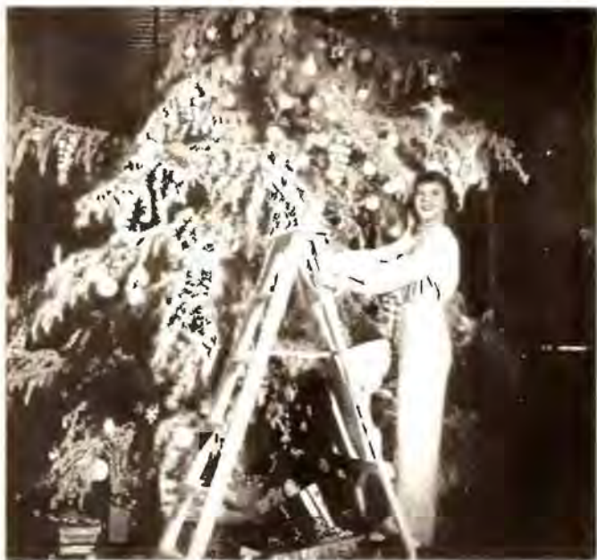
Mary Martin, star of NBC's Thursday night Good News program, is all set for the holidays with a Christmas tree that she trimmed all by herself.