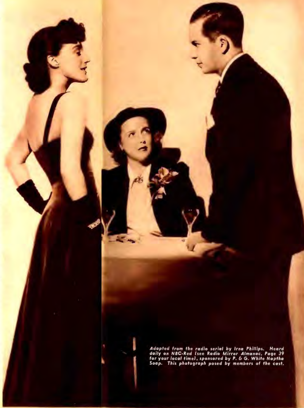
Adapted from the radio serial by Irna Phillips. Heard daily on NBC-Red (see Radio Mirror Almanac, Page 39 for your local time), sponsored by P. & G. White Naptha Soap. This photograph posed by members of the cast.

Dr. Ruthledge tried never to judge his fellow-man, but even his love for Ned could not blind him to his faults. He steadfastly refused to see his mother, the woman who