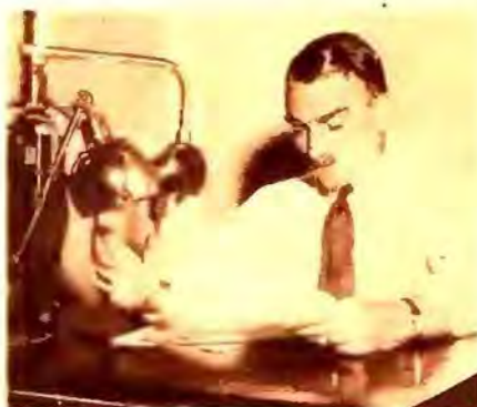
■ Boake's clipped, British accent is softened and Americanized now.