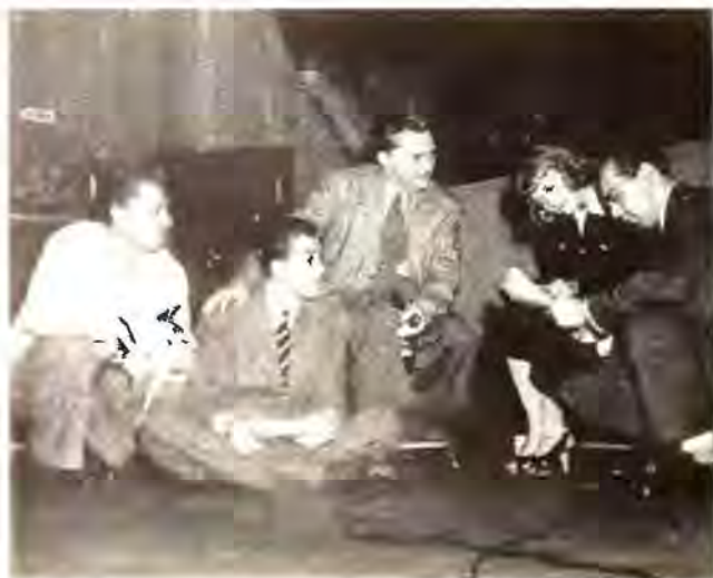
They take their Screen Actors Guild rehearsals seriously—left to right, Roger Pryor, Jimmy Stewart, Jean Hersholt, Margaret Sullivan and the script writer.