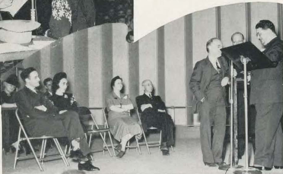
EVERY WEEK, ABOUT 90 PAGES of questions and answers are typed out for the Professor. From these, he selects 12 pages for use on each of his broadcasts. Some of them are very short (Above): "What is the shortest verse in the Bible?" Answer: "Jesus wept."