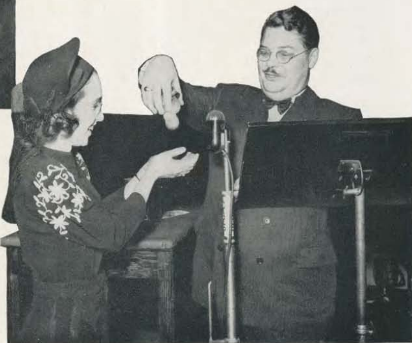
THE WINNER (Right), who happens to be our little lady of above, cups her hands to receive the twenty-five silver dollars. Runner-up gets fifteen silver dollars and the remaining contestants receive a package of the sponsor's product. From last reports, the Silver Dollar King has paid out an additional $30,000 to listeners who submit the best lists of five questions and answers each week. And here is one for the listeners—you've spent over $40,000 in stamps writing the Professor, who has received over 1,700,000 letters and over 12,000,000 questions. Figures—figures—when you fool around with a program like "The Battle of Wits," you get this way.