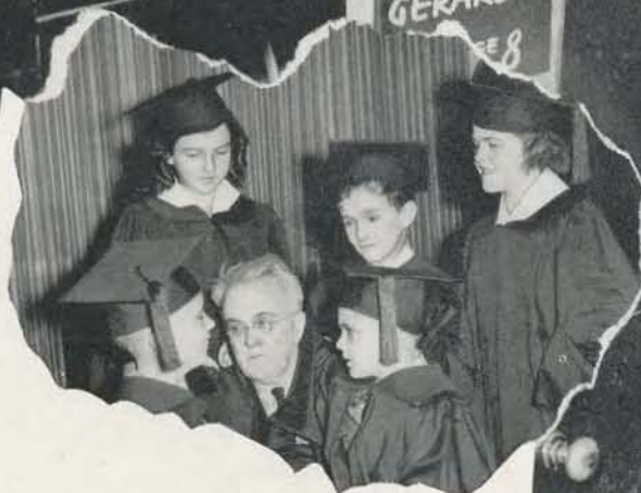
DR. ALLAN ROY DAFOE (Above), guest on the broadcast, invites the five to visit him and the Dionne quintuplets in Ontario.